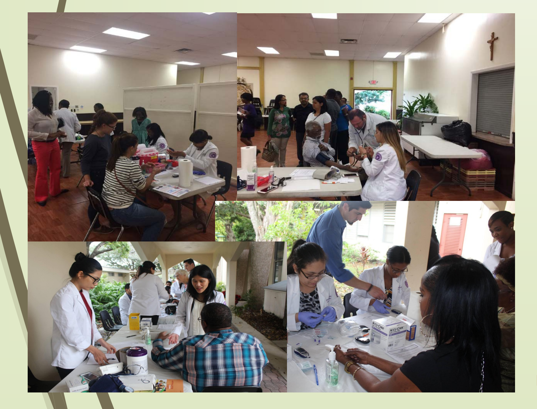
Figure 1 : Inter-professional health screening fairs

A total of 252 clients visited the screening centers