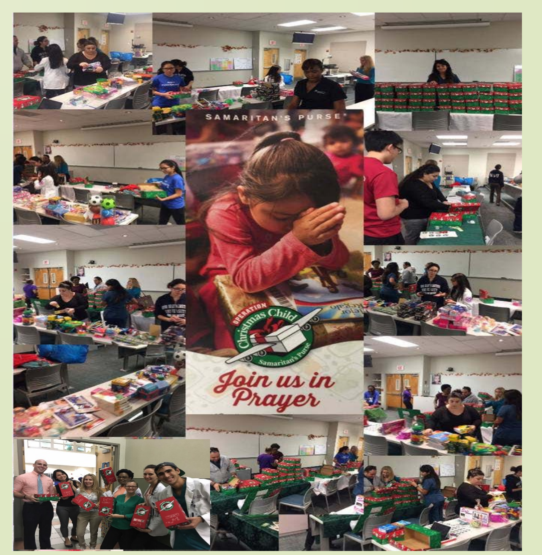
Figure 4: Operation Christmas Child 2016. Packaging of gifts in

Total donation collected, including good and funds was over $731, which was given to the Missionary Flights